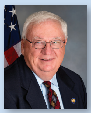
Senator | OHN BROOKS