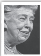
Eleanor Roosevelt (1884–1962)

Tubman escaped slavery in 1849 and became a conductor of the Underground Railroad. She risked her life to rescue slaves to freedom. She purchased land in Auburn in 1859 where she lived the rest of her life.