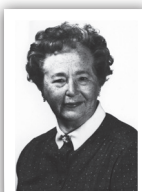
Gertrude B. Elion (1918–1999)

A lifelong New Yorker and first lady of the U.S. from 1933 to 1945, Roosevelt was a speaker and human rights advocate. She fought for disadvantaged Americans and drafted the UN Universal Declaration of Human Rights.