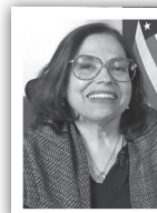
Judith Heumann (1947– )

Born in Brooklyn to immigrant parents, Chisholm was a member of the state Assembly and became the first African-American woman elected to Congress. In 1972, she was the first African-American and first female major-party candidate for the presidency.