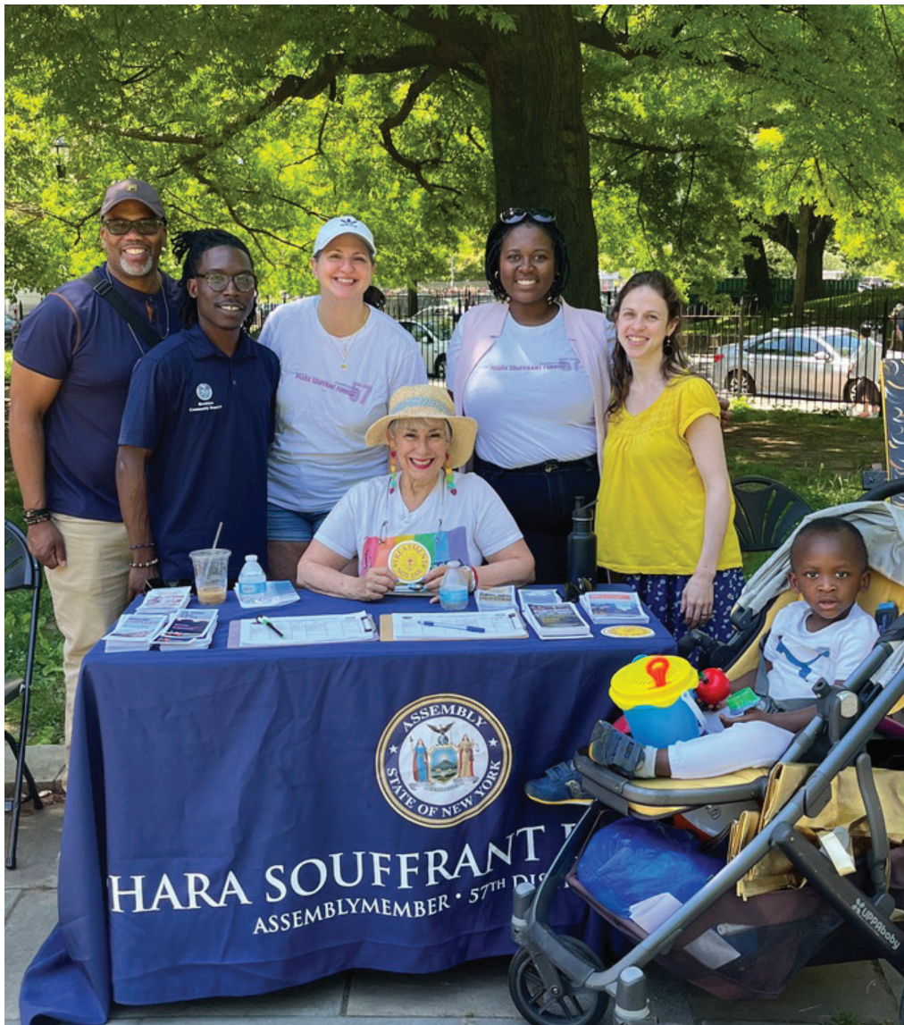
At Community Board 9's annual resource fair in Crown Heights

We have many volunteer opportunities for interested residents! Our volunteers help with everything from canvasses and phone banks to office work and constituent support. In addition, my office is now hosting a monthly housing clinic for constituents who need legal support with housing issues.