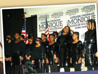
P.S. 276 Choir