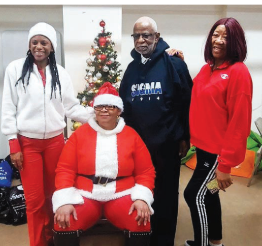
The Jimerson-Gorman Houses Holiday Toy Giveaway sponsored by the Assemblywoman was a festive event celebrated by the community.