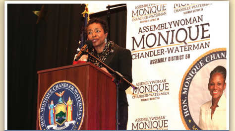
Rep. Yvette Clarke spoke of the years spent working with the Assemblywoman