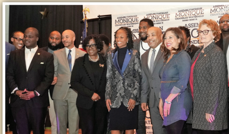
Elected officials from Brooklyn and beyond attended the Inauguration event