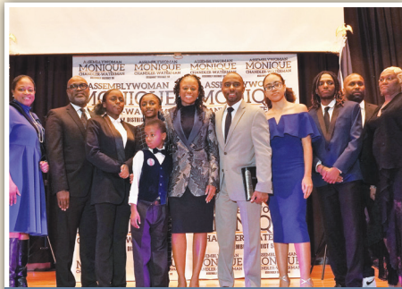
The Assemblywoman and her family