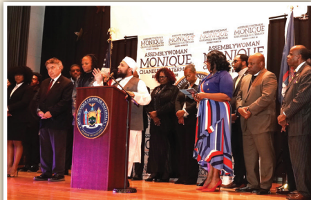
Faith Leaders from across AD 58 attended the event