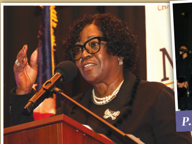
NYS Assembly Majority Leader Crystal Peoples-Stokes