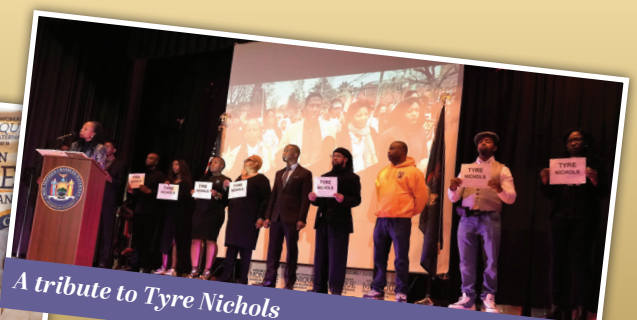
A tribute to Tyre Nichols