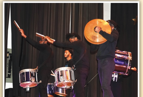
Blue Angels Drumline