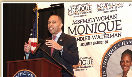
U.S. House Minority Leader Hakeem Jeffries lauded the Assemblywoman's hard work