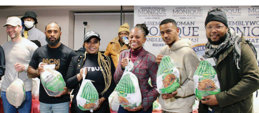
The Assemblywoman helped distribute turkeys to the tenants of Flatbush Gardens at the 13th Annual Thanksgiving Turkey Giveaway.