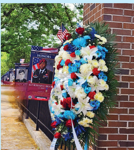
Local Heroes Memorialized at Canarsie Cemetery on Memorial Day