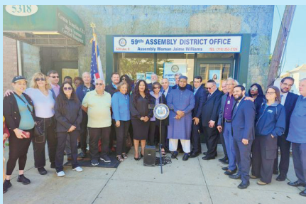
Press Conference regarding Anti-Semitic Incident