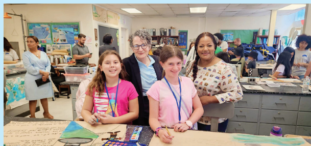
Summer Sea Stem at Kingsborough Community College with students and Interim President