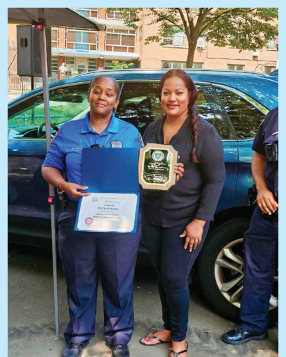
Bayview Family Day