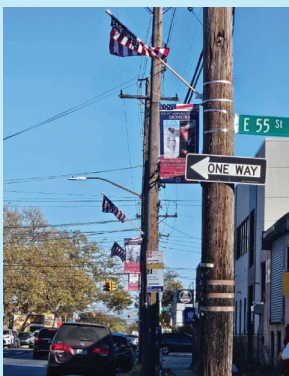
Veterans Day Display along Ave N