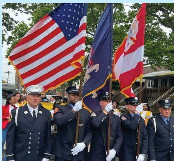
Canarsie Memorial Day Parade