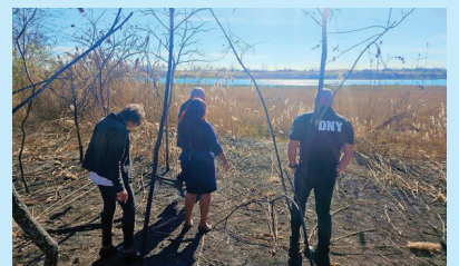
Tour of wildfires