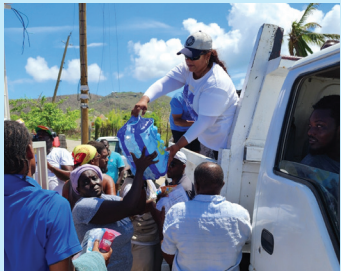
Hurricane Beryl Relief Efforts Carriacou