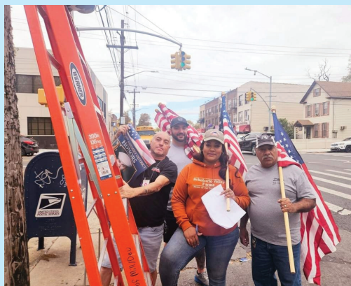
Veterans Day Display