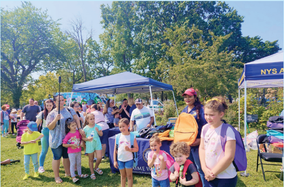
Back to School