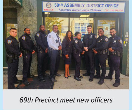
69th Precinct meet new officers