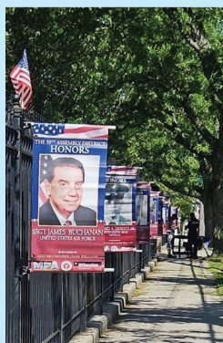
Memorial Day - Canarsie