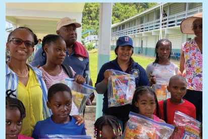
School packets distributed at the Boca Secondary School in Grenada