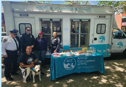
I love My Pet Day Event