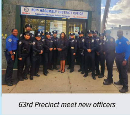
63rd Precinct meet new officers