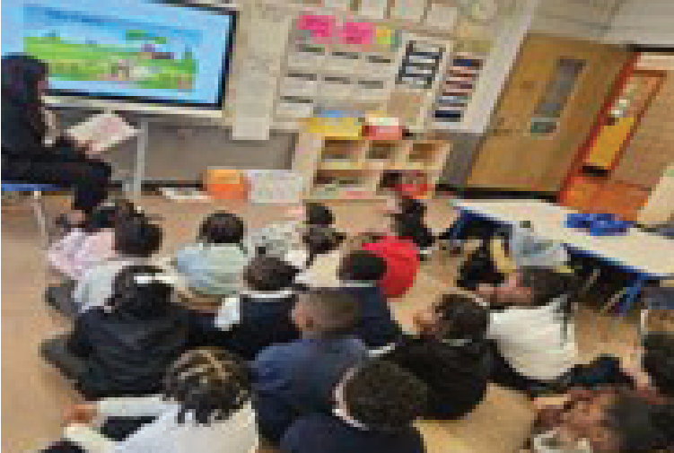
Re-aloud at P.S. 272 with young scholars

New York State Assembly Albany, New York 12248 PRSRT STD. U.S. POSTAGE PAID Albany, New York Permit No. 75