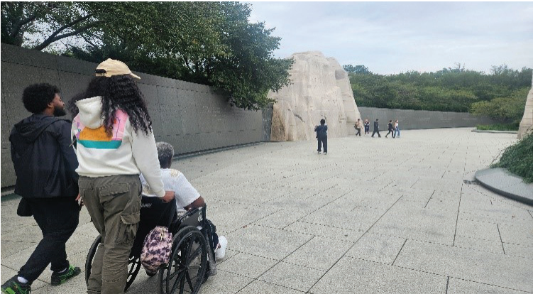
Washington, D.C. trip with Bayview Houses