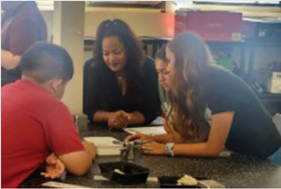
Assemblymember Williams engaging with STEM students