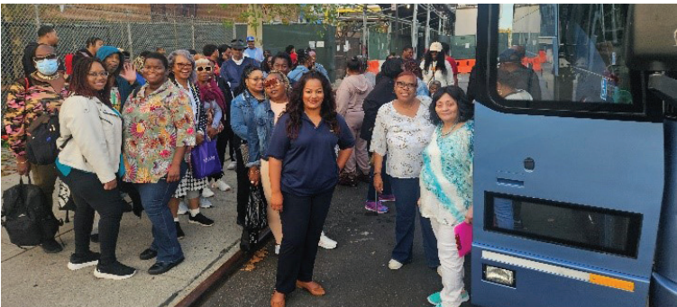
Bus trip to Washington, D.C. with Bayview Houses