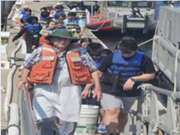
Touring the CUNY I Vessel