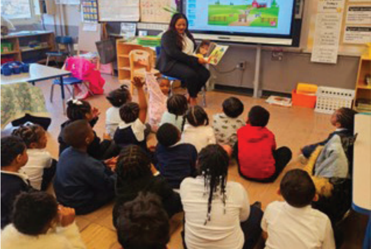
Re-aloud at P.S. 272 with young scholars