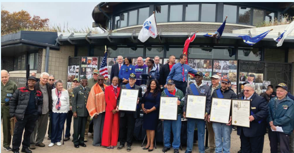
Honoring our Veterans

I am happy to secure additional state funding for NHS to provide HOMEOWNERS WITH REPAIR INFORMATIONAL WORKSHOPS AND COMMUNITY EVENTS FOR THE RESIDENTS LIVING IN CANARSIE.