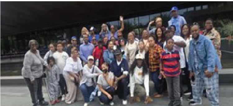
Bayview Houses trip to Washington, D.C.