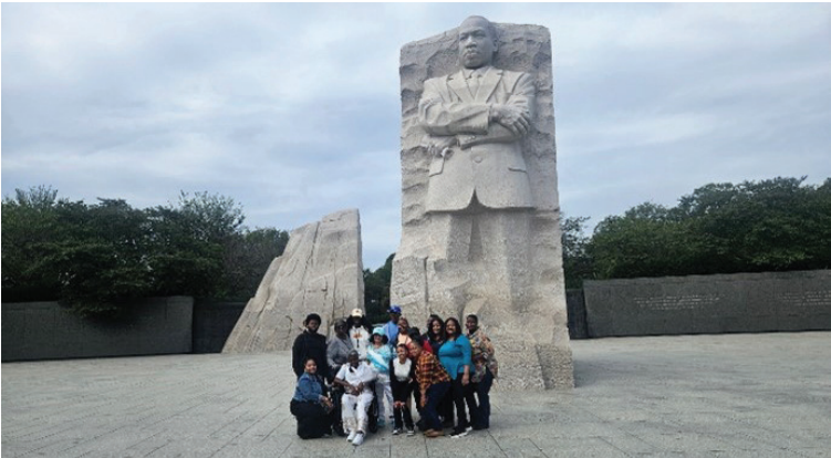
Visit to Dr. Martin Luther King, Jr. Monument