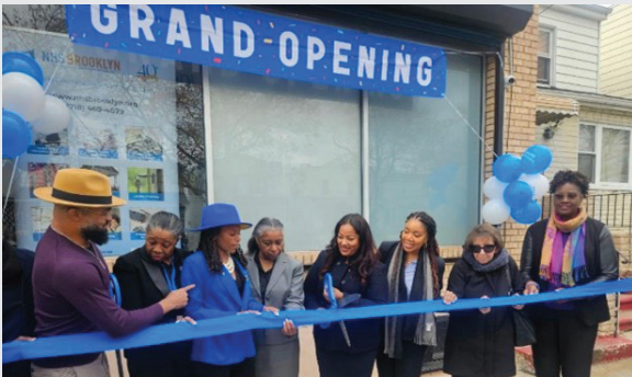
NHS new building ribbon cutting