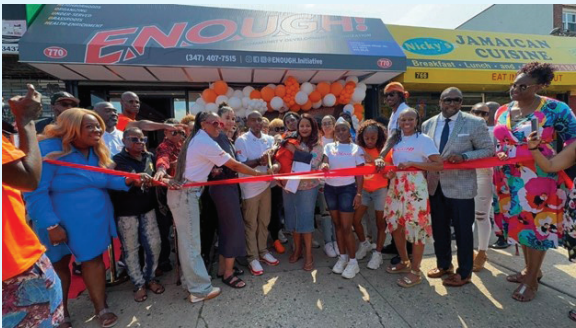
E.N.O.U.G.H. Anti-Violence Initiative Opens in Canarsie

In response to the recent uptick in gun violence in the Canarsie area, I—alongside my colleagues in government—have invested in and supported East Flatbush Village, Inc., an organization that has long been on the frontlines of violence prevention in our community. Through this partnership, we launched the E.N.O.U.G.H. Anti-Violence Initiative , a comprehensive effort focused on preventing violence, engaging high-risk and at-risk youth, and connecting underserved community members to critical resources. Our goal is to create safer streets, stronger families, and a community where every resident feels protected and supported.