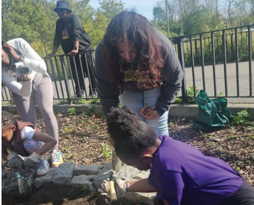
Daffodil Planting in Canarsie Park with P.S. 276 Girl Scout Troop