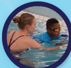
Heated Indoor Pool