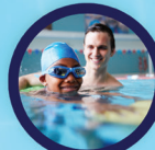
Beginner Swim Classes