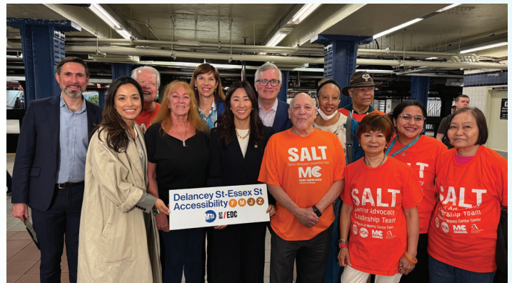
Championing the new accessible elevators coming to the Delancey-Essex Station with community advocates.