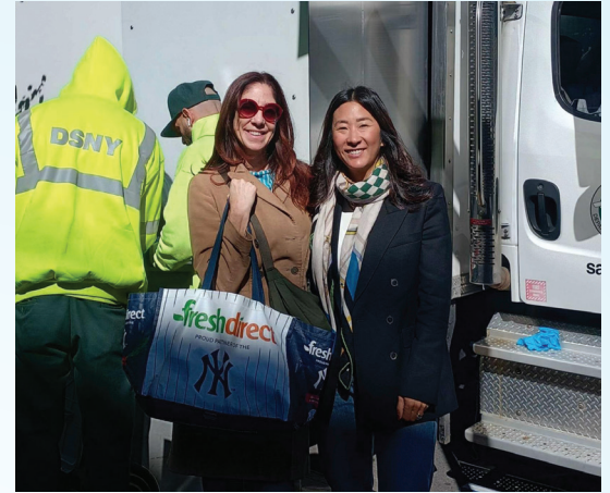
Hosting a free paper shredding event on the LES

🚧 When a local business repeatedly blocked the sidewalk with construction materials, we worked with the Department of Sanitation to remove the materials and keep the sidewalk clear for pedestrians .