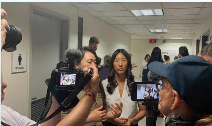
Escorted people to immigration court, witnessing the violation of due process by masked ICE agents at 26 Federal Plaza.