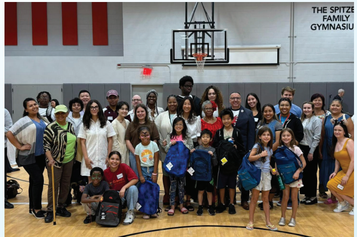
Providing over 1,000 free backpacks to families at our Back-To-School giveaway co-hosted with Grand Street Settlement.

Trivia Answers: 1. City Hall 2. The Chinatown Gateway 3. Economy Candy