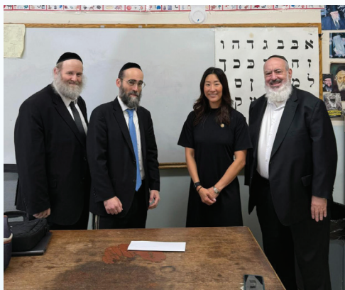
Meeting with Rabbis at Mesivtha Tifereth Jerusalem of America.