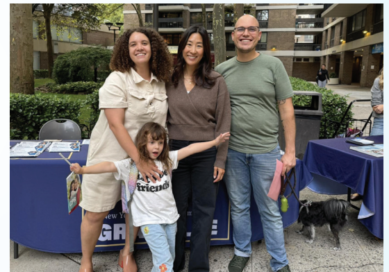
Meeting constituents at "Mobile Office Hours"