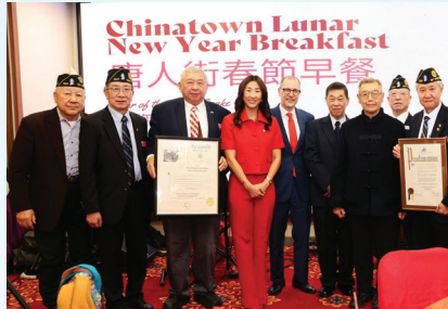
American Legion Lt. B.R. Kimlau Memorial Post