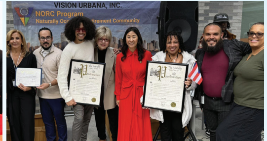
Vision Urbana, Tareake Dorill, Casa Adela, Grand Street Settlement