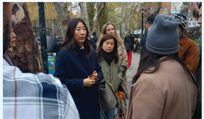
Joined SDR Park Alliance and CB3 for a safety walkthrough of Sara D. Roosevelt Park with the Parks Commissioner and NYPD.