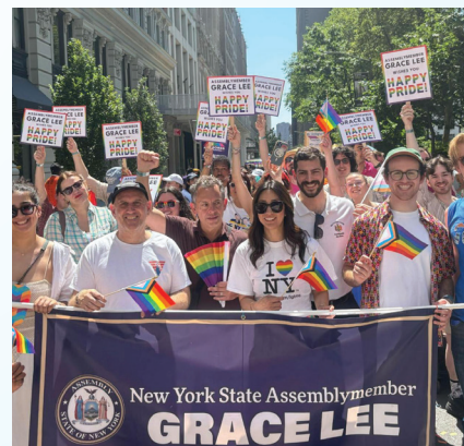
Celebrating LGBTQIA+ Pride at the 2025 Pride March.