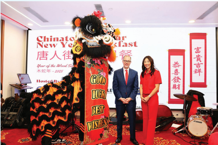
Celebrating the Year of the Snake and the first year of a statewide public school holiday for Lunar New Year.