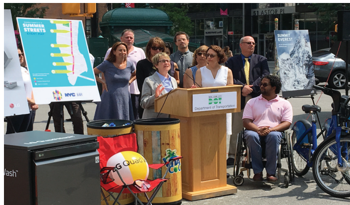
Celebrating another year of Summer Streets with Department of Transportation's Commissioner Polly Trottenberg. This annual, car-free event allows people to see the City from a different vantage point and without the congestion of car traffic.

More information on the amendments can be found here at https://www.elections.ny.gov/ProposedAmendments.html .