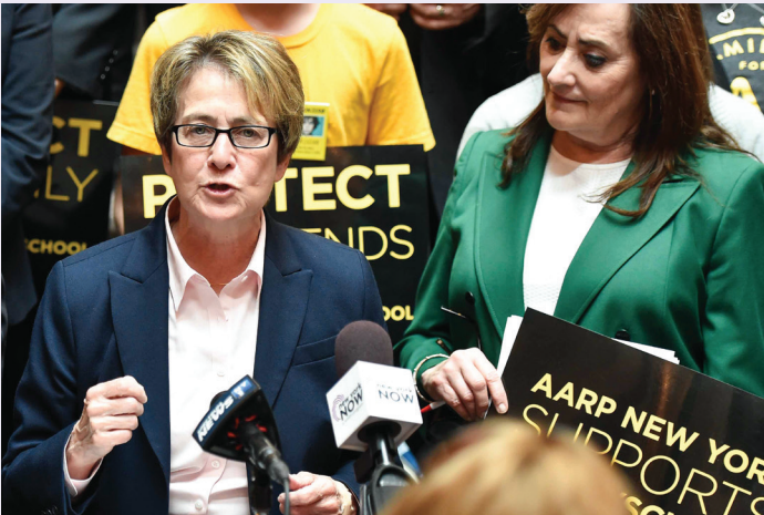
Advocating for my bill which would authorize an increase in speed cameras in school zones throughout New York City. The exiting pilot program has proven extremely successful at reducing speeding and keeping our children safe.

Teaching used to be a highly respected career. We must work aggressively to overcome a decade of denigration of teachers by political