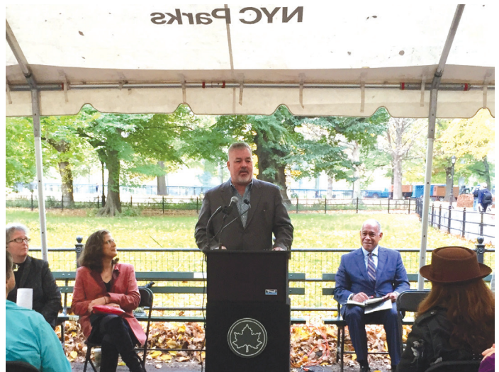
Council Member Helen Rosenthal, Assembly Member O'Donnell, and Parks Commissioner Mitchell Silver.

The Westside Campaign Against Hunger is invaluable at tackling food insecurity in the city. With supermarket-style food pantries, cooking classes, and clothing donations, WSCAH empowers the people it serves. I was happy to allocate $100,000 in capital funds to upgrade the food pantry, install a new phone system, and purchase a new mobile food truck to reach more New Yorkers in need.