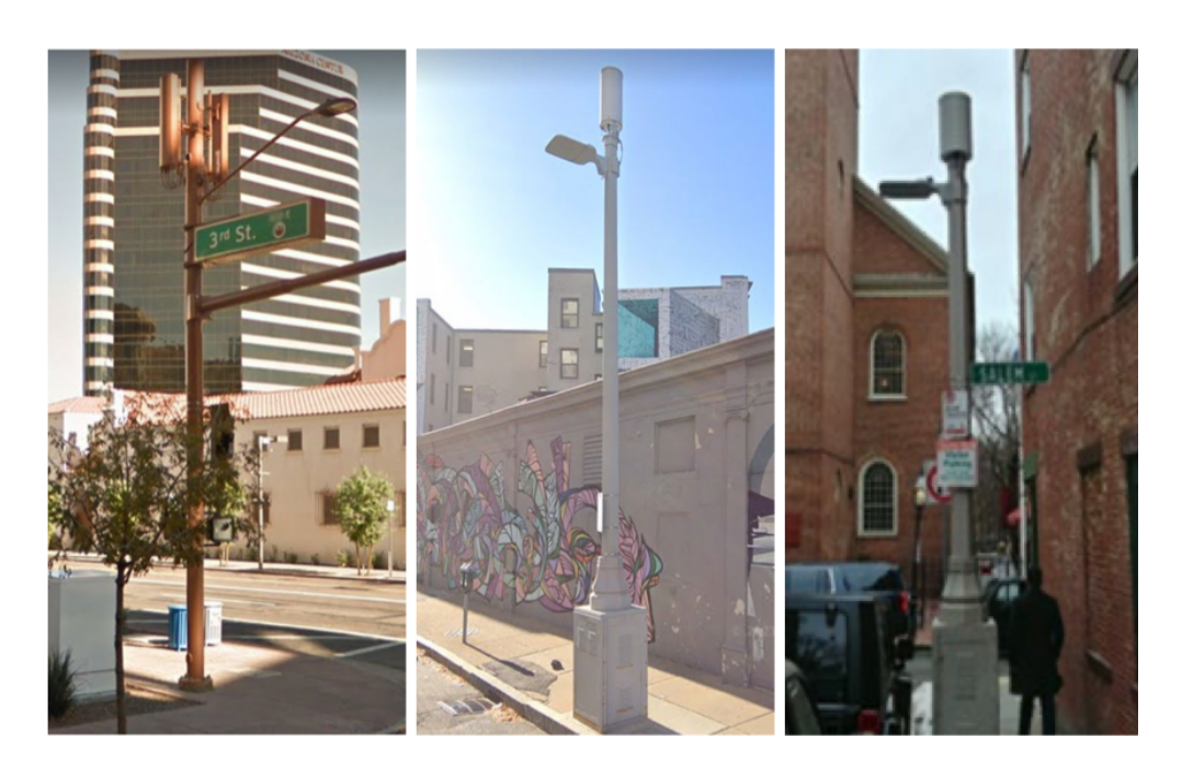
Small cells on existing poles in Phoenix and Boston<sup>44</sup>

Some of the most successful 5G programs in the country rely almost exclusively on placing small cells on existing street furniture. Compared to building new cell towers or infrastructure, utilizing existing poles significantly reduces the time and cost required for network expansion. Pole-mounted small cells can be deployed more quickly, as they generally require fewer permits and minimal infrastructure modifications. This agility enables telecommunications providers to respond faster to capacity demands, provide coverage in underserved areas, and accommodate temporary events.<sup>43</sup>