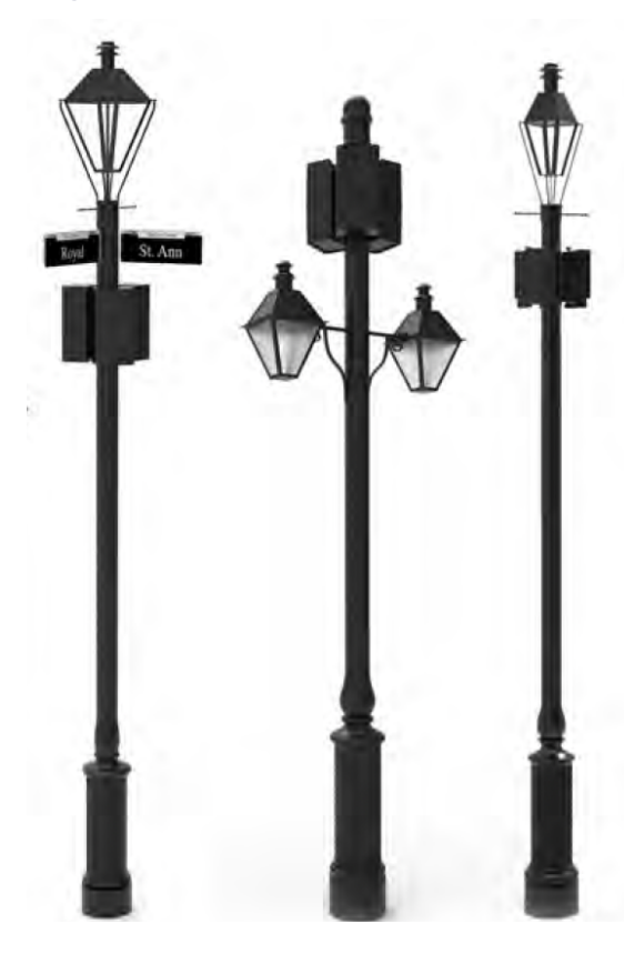
New Orleans, Louisiana<sup>46</sup>

In some cities, the design guidelines for small cells include specifications to ensure that the installations integrate seamlessly. Others, like New Orleans, strive to make the additions cohesive with the unique character of a neighborhood.