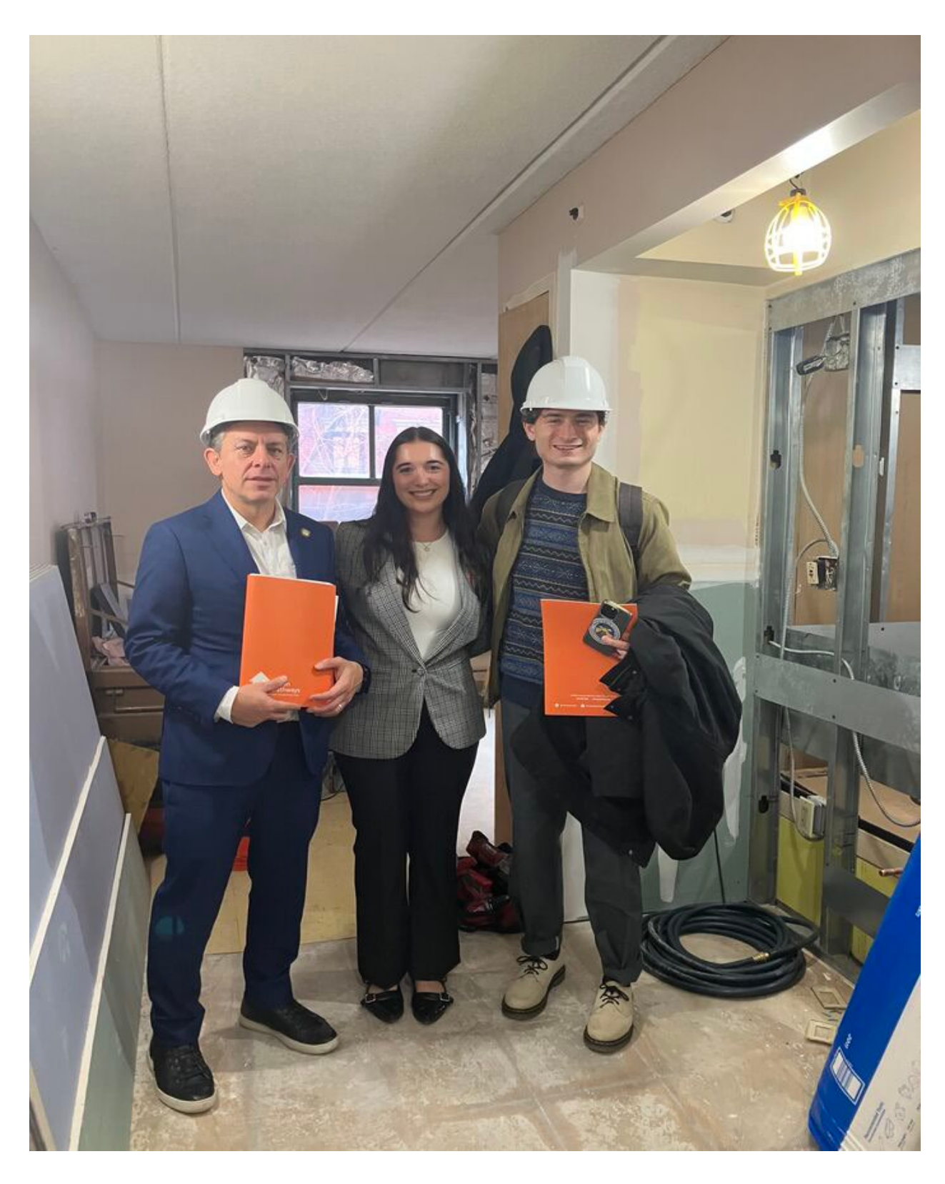
A photo of my visit to a unit in the Ivan Shapiro House currently undergoing capital improvements