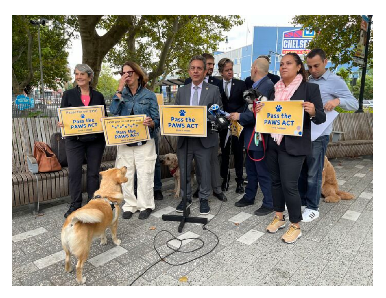
A photo from my PAWs press conference attended by my co-sponsor, Senator Andrew Gounardes

results in a fine equivalent to an illegal U-turn. This is not enough to be an effective deterrent for drivers to remain safe in areas with household pets and my bill would substantially increase the penalty for hitting a pet and for leaving the scene after hitting a pet to be the same level it is for hitting a person. This bill also creates a historic new legal category of "companion animal" which will be able to be used in future legislation to protect our furry friends.