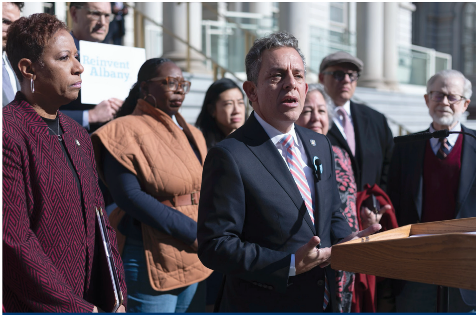
Assemblymember Simone Speaking At City Hall to Strengthen Democracy.

With a long record of attacks on voting rights coming from the federal government, such as the effort to dismantle the Post Office 1 and challenges to the Voting Rights Act 2 , it is more important now than ever to ensure all New Yorkers can safely and securely vote.