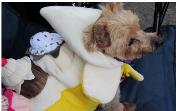
Chloe the banana split