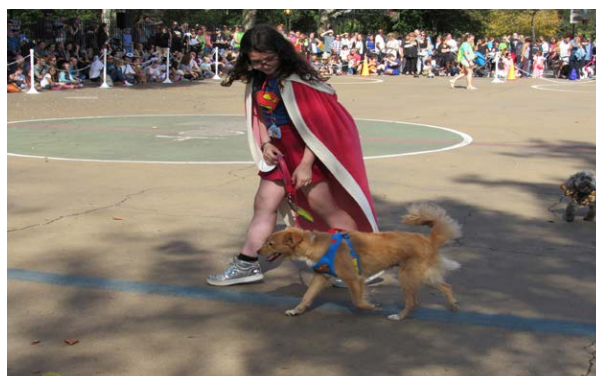
Supergirl and superdog