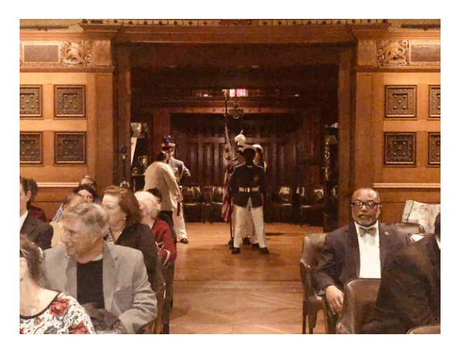
The Knickerbocker Greys, founded in 1881, is a non-profit and the oldest after school program for children ages 6 to 16 in New York City.