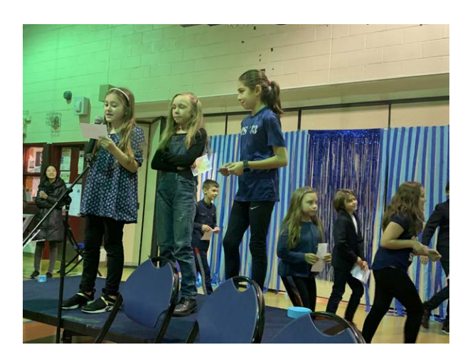
Fifth grade students spoke about what PS183 means to them.