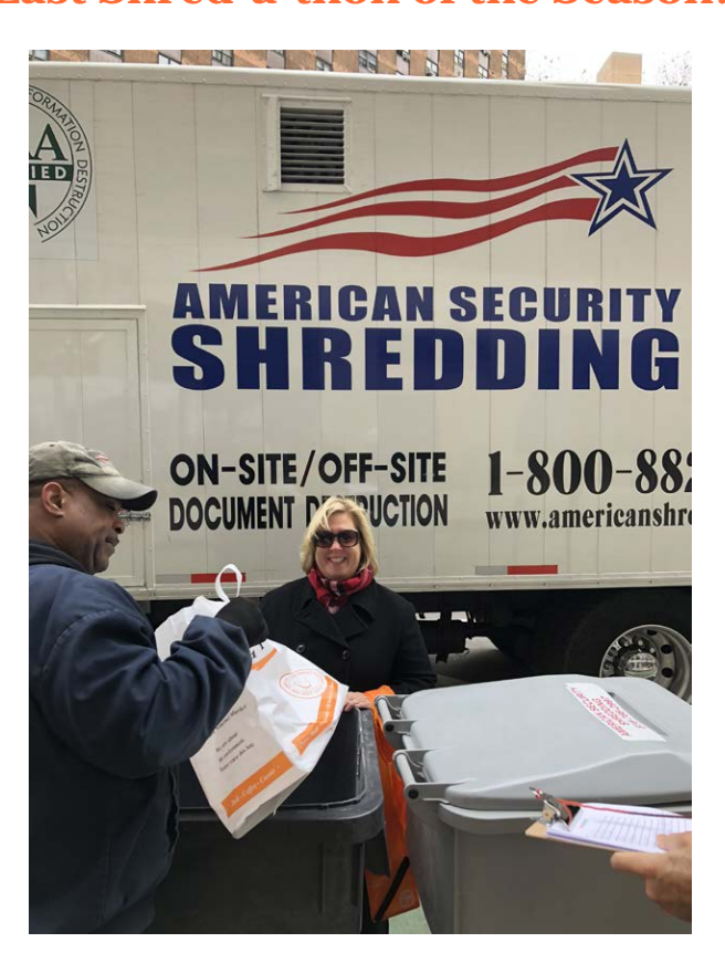
Assembly Member Seawright is pleased to provide grant funding to the Upper Green Side non-profit to help constituents protect their identity.