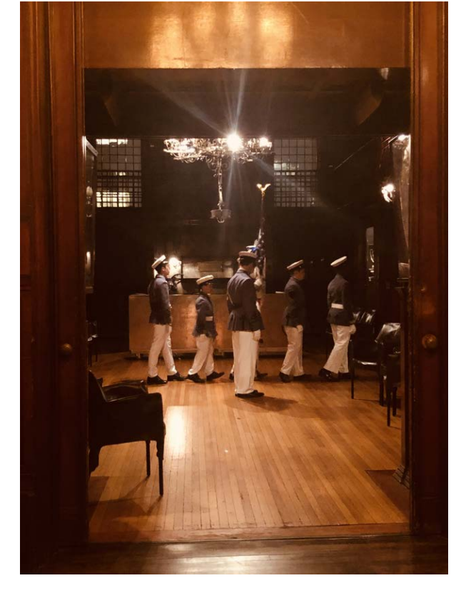
The Knickerbocker Greys entering the Veterans Room to present the colors.