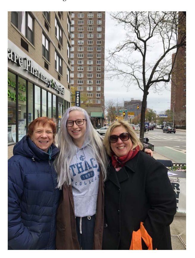
Standing with constituents who braved the cold to shred old documents.