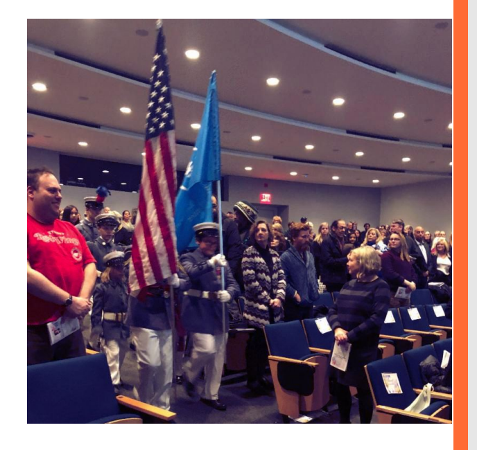
Knickerbocker Greys from the Park Avenue Armory joined the celebration!