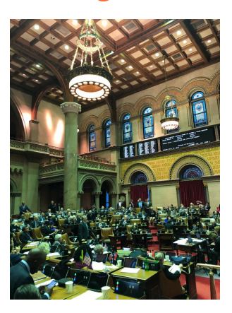
Chambers at 2:00am on Monday, April 1.