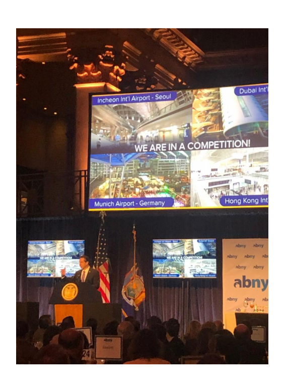
2019 Mission Society Reception