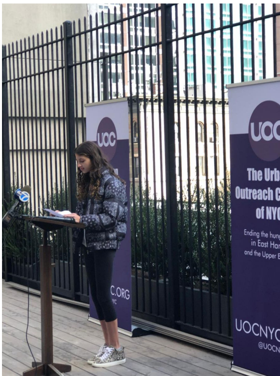
A student from East Side Middle School welcomes the new center at the ribbon cutting on Thursday morning.

Both the Urban Outreach Center and Avenue Church are members of East Side Taskforce for Homeless Services, combining the efforts of the local faith-based and non-profit organizations, electeds, and city agencies to help homeless individuals off the street and to the services they require.