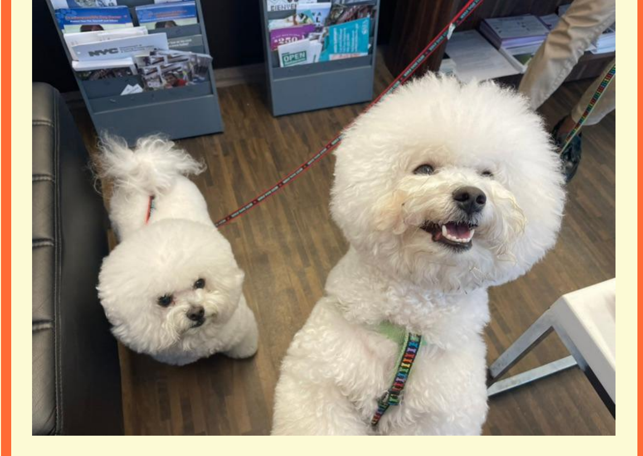
Pawsitively perfect constituents. Prince Mickey and his brother Walter White visited the district office for a treat!