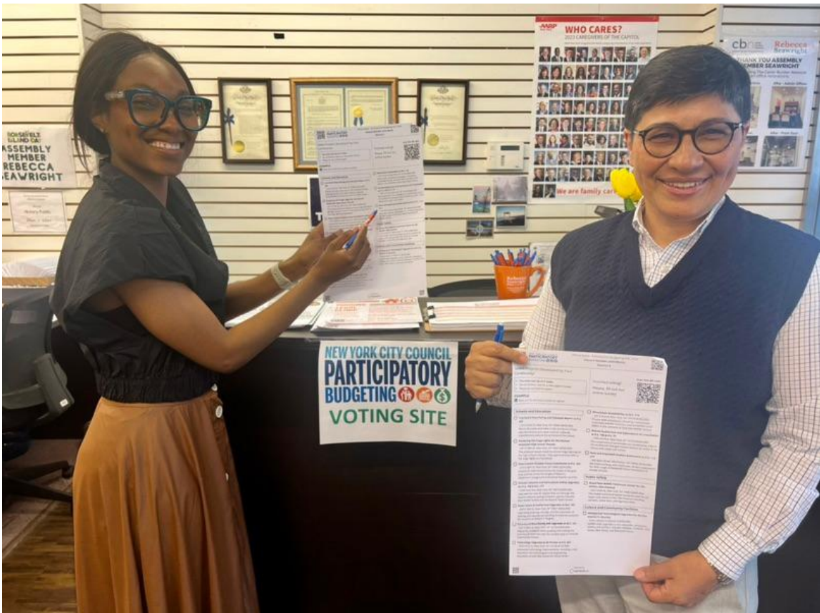
Our community office served as a site for City Council District 5 participatory budgeting. Residents filled out their ballots to decide how to spend $1,000,000!