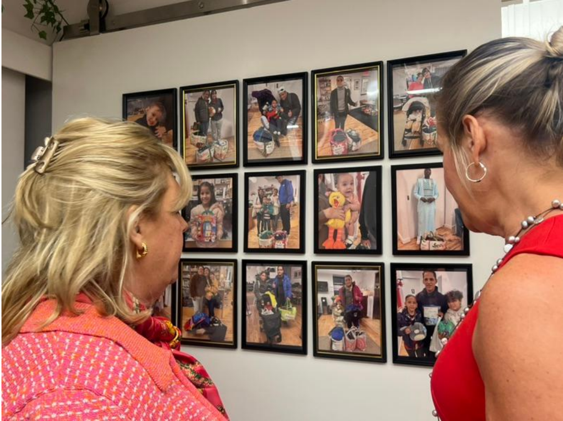
Photographs of the appreciative families hang on the walls of the store.