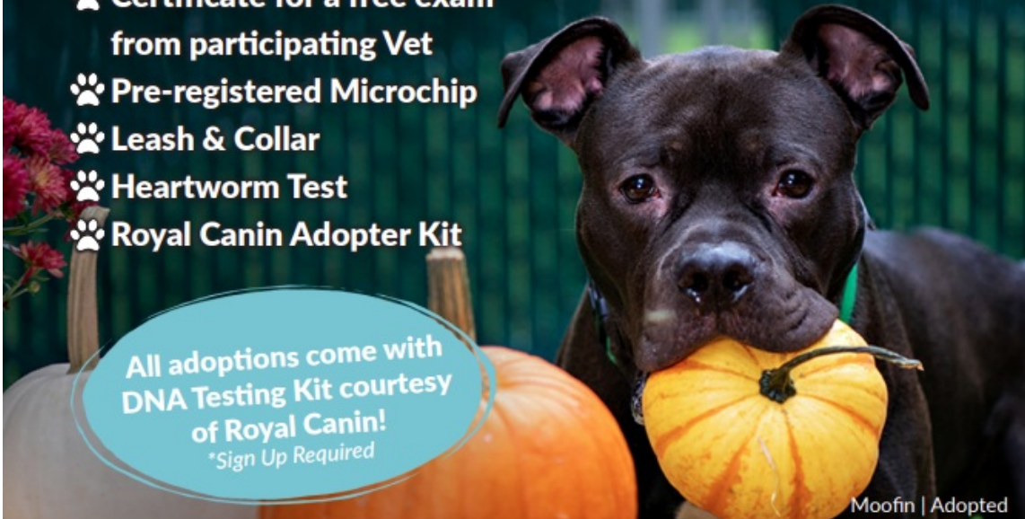
Moofin | Adopted

All adoptions come with DNA Testing Kit courtesy of Royal Canin! *Sign Up Required