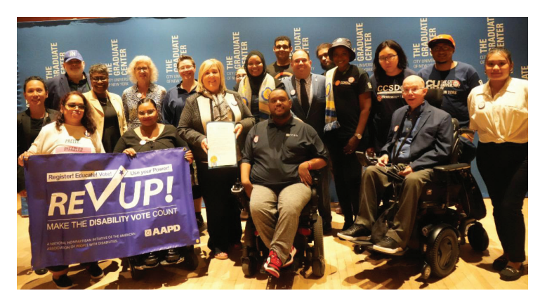
CUNY Graduate School and University Center, the CUNY Graduate Center, and the NY State Disability Services Council.

The coalition of students with disabilities (pictured here) includes CUNY Votes, the CUNY Office of Disability Programs, the New York Coalition of Students in Higher Education with Disabilities, the CUNY Coalition for Students with Disabilities (CCSD), the New York Public Interest Research Group (NYPIRG), the Viscardi Center, Quality Services for the Autism Community (QSAC), the