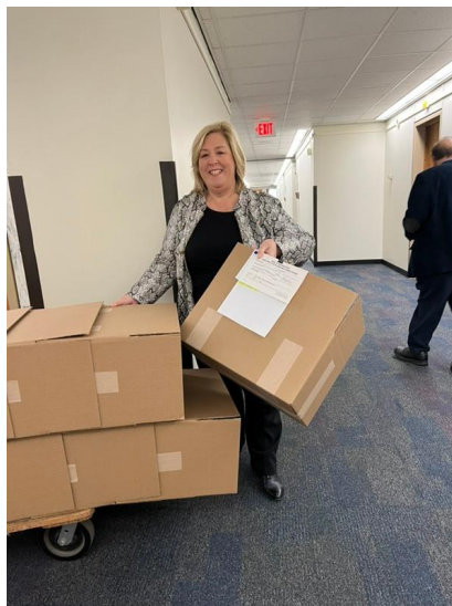
Seawright moving to the new Aging Committee office.