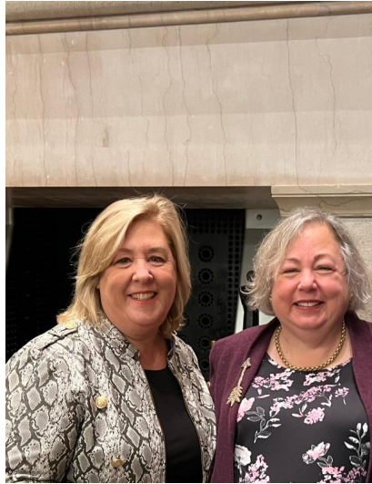
Assembly Member Rebecca Seawright and New York State Senator Liz Krueger on the opening day of the legislative session, January 8, 2025.