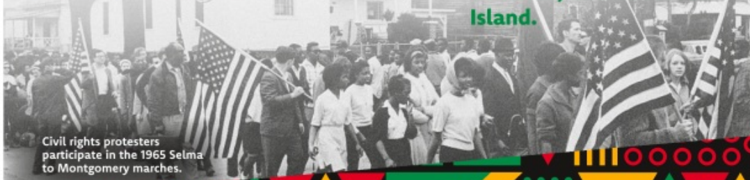
Civil rights protesters participate in the 1965 Selma to Montgomery marches.

is sponsoring a National Black History Month essay contest, with awards going to the top entries from schools in the Upper East Side, Yorkville, and Roosevelt Island.