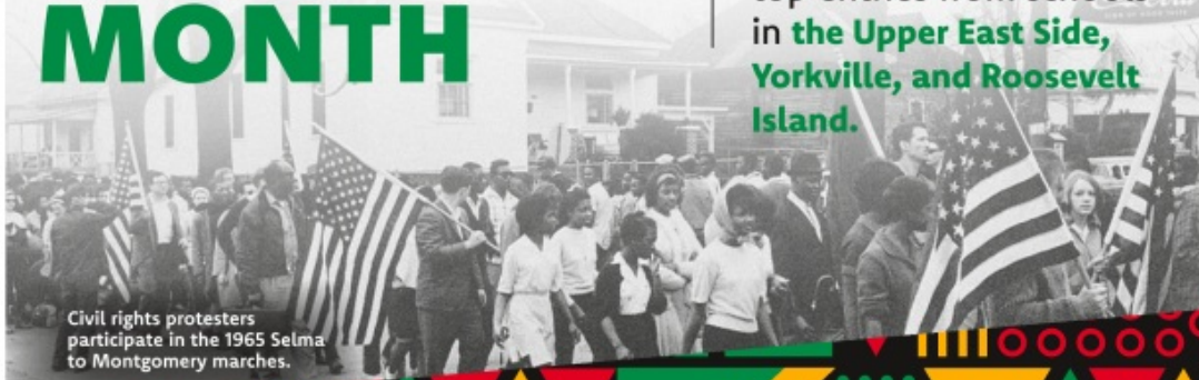
Civil rights protesters participate in the 1965 Selma to Montgomery marches.

is sponsoring a National Black History Month essay contest, with awards going to the top entries from schools in the Upper East Side, Yorkville, and Roosevelt Island.