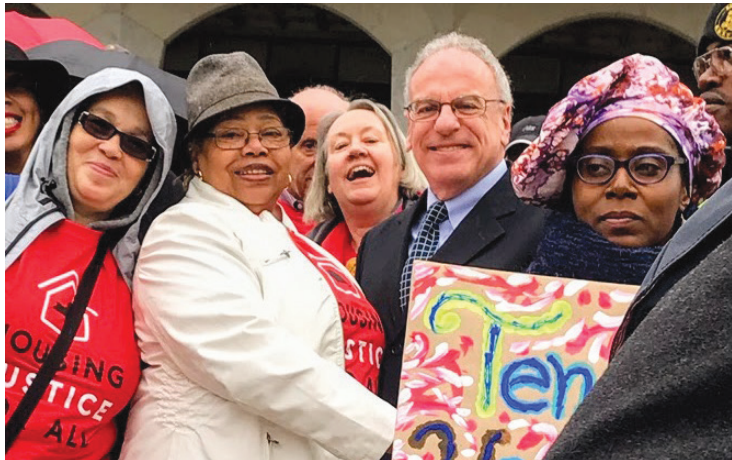
Victory for Tenants: One of my long-time priorities as your Assemblyman has been to fight for more tenant protections in Albany. I am proud to have stood with housing advocates this spring demanding rent reform, and I am even prouder that we won so many important victories for tenants in New York. Please contact my office with any questions you may have with your landlord and compliance with the new laws.

be vaccinated too. No child made the choice to have leukemia or AIDS or any other cause for a compromised immune system, and they have every right to attend school without fear of a preventable outbreak of measles or other communicable disease.