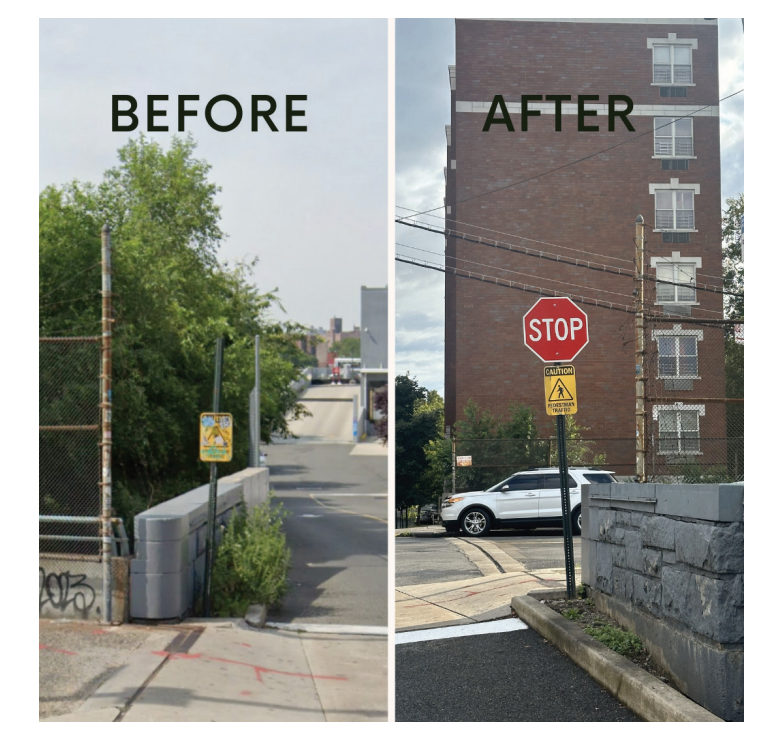
Before and After of the Stop Sign being replaced.

Our office successfully facilitated the replacement of a crucial stop sign that had been removed at the busy intersection of West 238th Street and Putnam Avenue, right by BJ's. This intersection saw significant pedestrian and vehicle traffic, and the missing stop sign posed a severe safety risk to the community. By working swiftly with city officials, we ensured the installation of a new stop sign, reinforcing our commitment to keeping our streets safe for drivers and pedestrians alike.