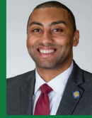
NYS Senator Jamaal Bailey