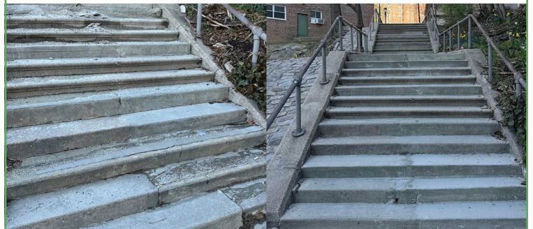
Pictured: Conditions of staircase located at 536 Kappock Street before and after repairs by the NYC DOT were made.

These stairs posed a safety hazard for the community residents that use them daily and had only continued to deteriorate over time without necessary repairs. Residents had previously reported the damaged sidewalk to 311, but were unable to secure a resolution through these complaints alone. Community input and 311 numbers from constituents were essential in my communications with NYC DOT, as reports directly from constituents are needed for the 311 system. This repair is a huge win for the community, and I appreciate NYC DOT's ongoing communication and collaboration with my office to make it happen.