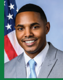
Congressman Ritchie Torres