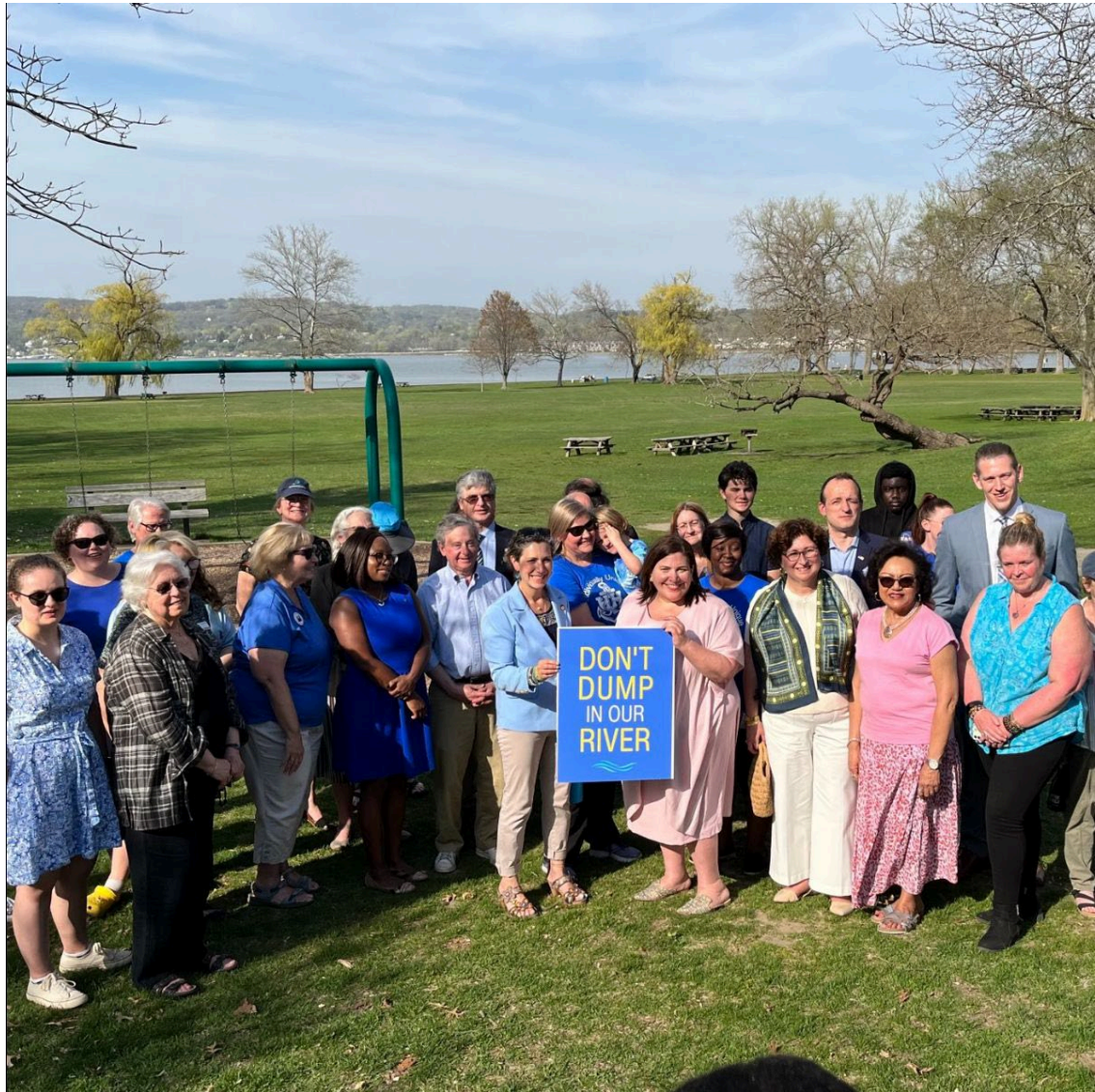
Rally on the bill at Croton Point Park in June.