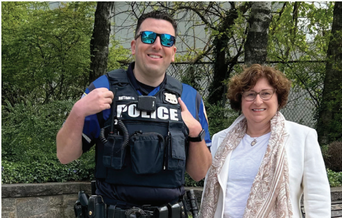
At The WAY's Drug Take Back Day in Hastings-on-Hudson