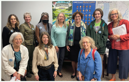
Meeting with local advocates for the Bigger, Better Bottle Bill