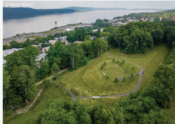
Quarry Park was officially dedicated on June 23, at Hastings' Marbleous! event.

New parks don't come into existence very often. Twenty-four years in the making, the Hastings-on-Hudson community finally cut the ribbon this June on the new Quarry Park. With beautiful Hudson River views along the Old Croton Aqueduct trail, the site has a storied past as a fine marble quarry, private garden, and—during its time as a Village garbage dump—the hiding spot for purloined Cold War-era documents. Congratulations to everyone who persevered to make Quarry Park possible!