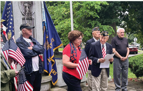
Memorial Day at Patriots Park, Tarrytown/Sleepy Hollow