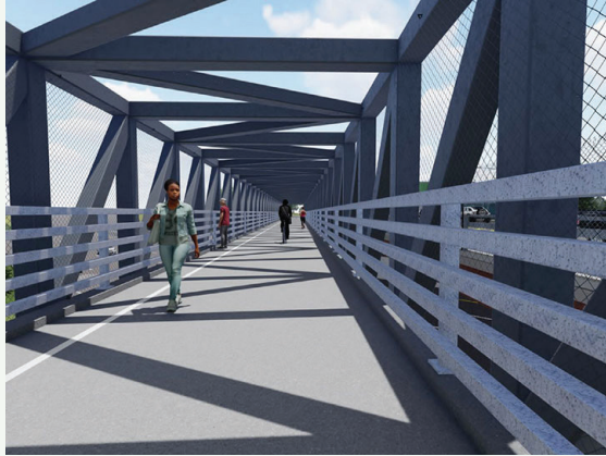
Daytime and Paulding Avenue renderings

A new 270-foot-long pedestrian/bicycle bridge was installed over I-87/I-287 in Tarrytown this summer. It is the centerpiece of a $13.9 million multifaceted project extending the Governor Mario M. Cuomo Bridge side path one mile south to Lyndhurst Mansion. The project also adds a second left turn lane from South Broadway to the southbound Thruway entrance ramp and installs a traffic signal on Route 9 at Paulding Avenue, among other improvements.