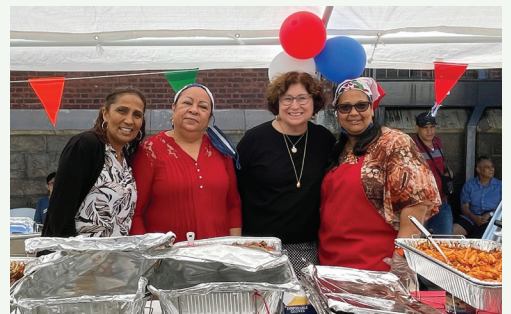
Meeting the chefs at the Sleepy Hollow Multicultural Festival