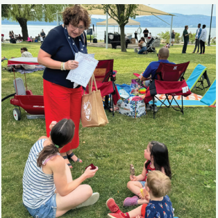
Meeting young families at the Dobbs Ferry waterfront