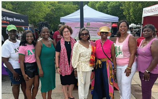
African American Heritage Festival at Kensico Dam Plaza, Valhalla with Alpha Kappa Alpha Sorority members