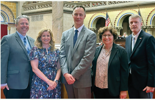
Welcoming Mayor Rutyna and Sleepy Hollow officials to the Assembly Chambers