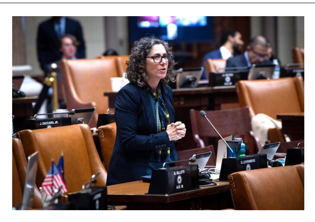
Fiscal Year 2025 Enacted State Budget