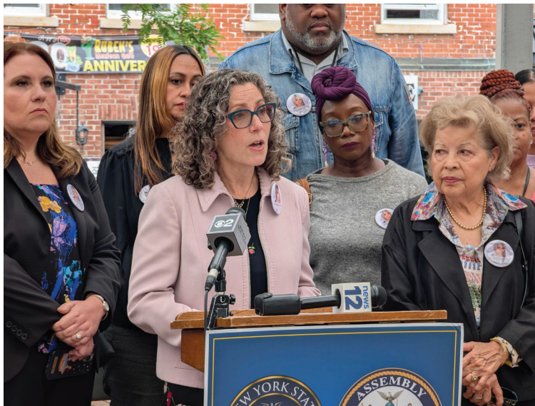
Speaking at a press conference in support of public safety legislation.

It is an honor and a privilege to represent the 95th District in the Assembly. In this newsletter, you'll find updates from Albany and around the district. If you would like more frequent updates, I encourage you to sign up for my e-news at https://bit.ly/AD95E-News , visit my website ( https://bit.ly/Levenberg ) and follow me on social media. I am @AMDanaLevenberg on Facebook, Instagram and Bluesky.