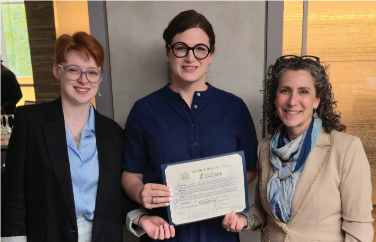
Honoring KinoSaito Arts Center at a Hudson Valley Gateway Chamber of Commerce event.