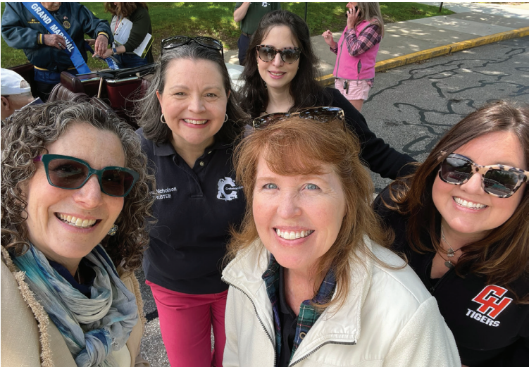
With Cortlandt and Croton officials at the Croton Summerfest parade.