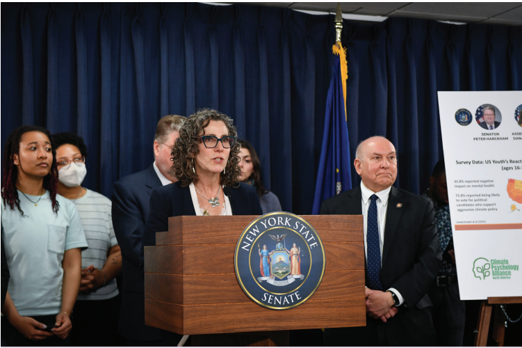
Holding a press conference about the mental health impacts of climate change.