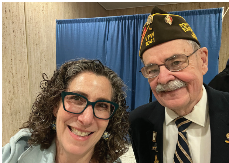
Honoring local veterans at an event in Albany.

To learn more about this year's state budget, visit https://nyassembly.gov/2025budget . This was a tough budget cycle, especially given federal funding uncertainties, and I will keep pushing our federal representatives to provide sufficient funding for our state's needs; I hope you will join me.