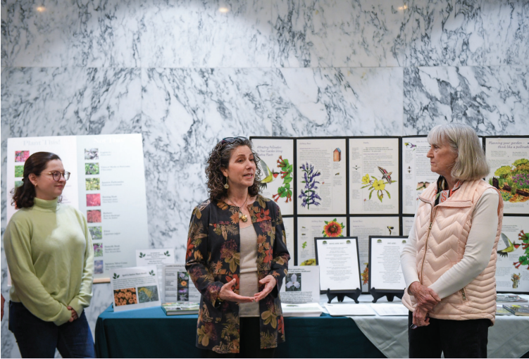
Hosting an exhibition about native plants in the State Capitol, in collaboration with local members of New York State’s Garden Club of America affiliates.