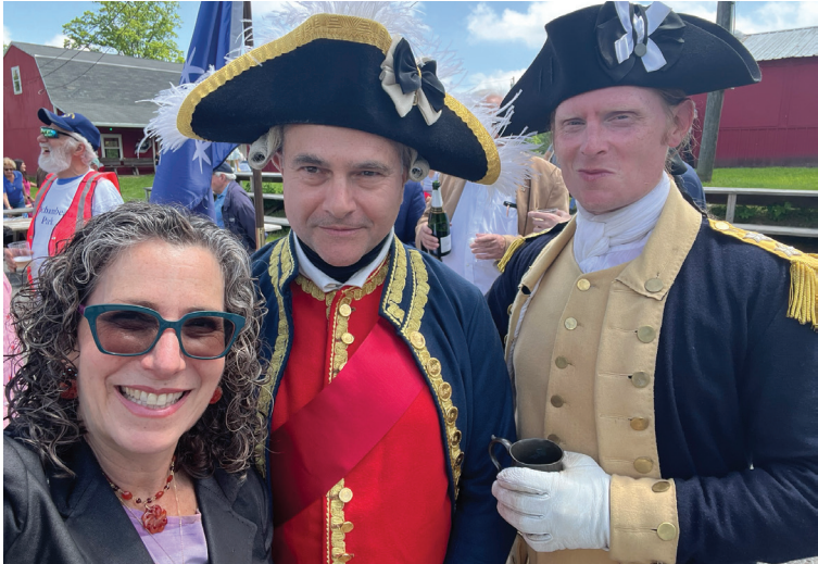
At the Rochambeau Festival in Yorktown.

New York State Assembly Albany, New York 12248 PRSRT STD. U.S. POSTAGE PAID Albany, New York Permit No. 75