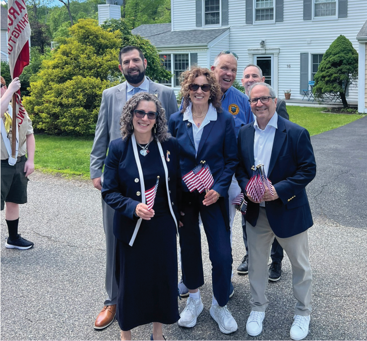
With the Board of Trustees at the Briarcliff Manor Memorial Day parade.