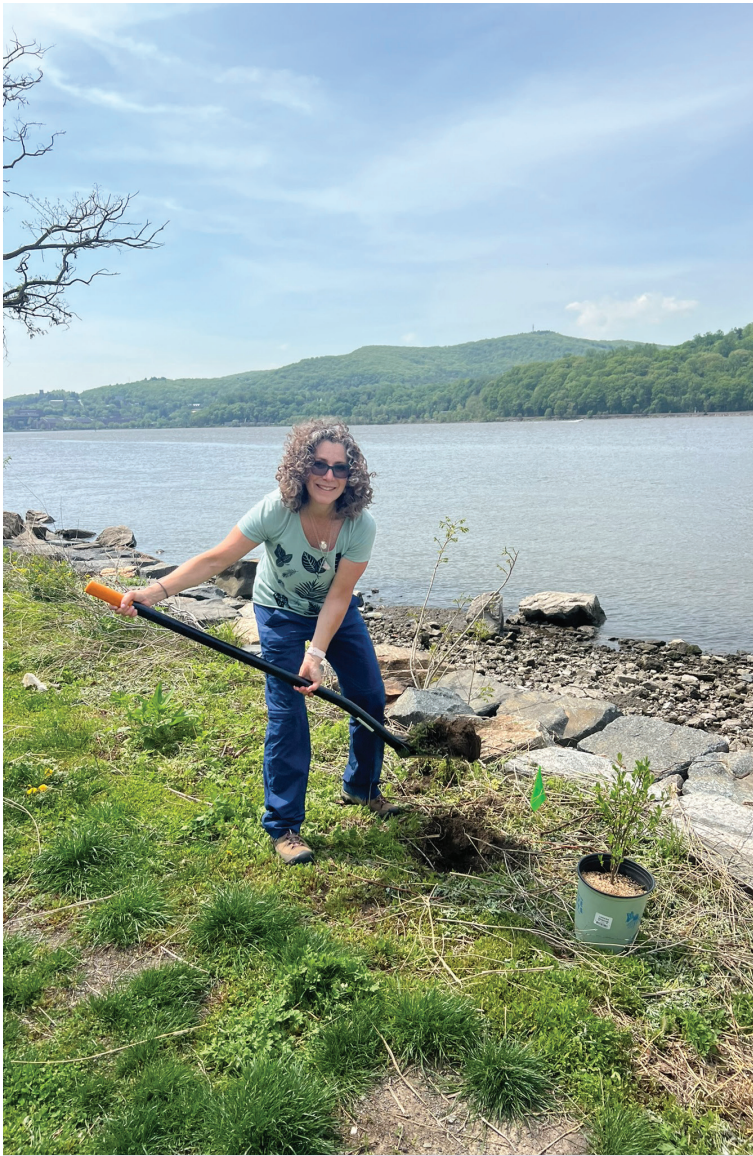
Replacing invasive species with native plants at Dockside Park in Cold Spring during the Riverkeeper Sweep.