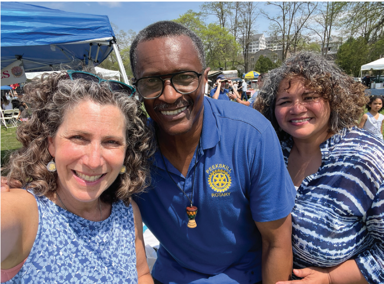
At the Peekskill Rotary Club Cherry Blossom Festival.