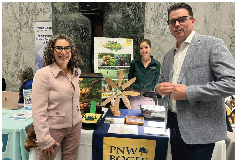
Visiting our local Board of Cooperative Education Services (BOCES) table at the BOCES Fair in the State Capitol.