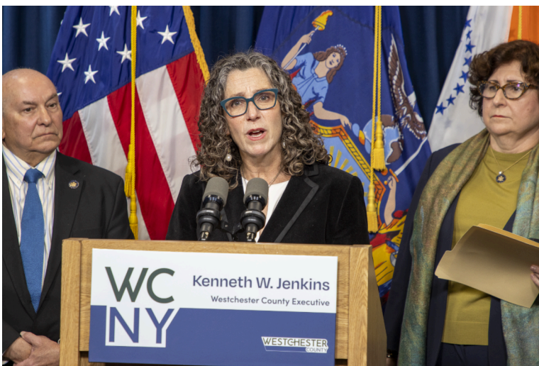
Opposing Con Ed rate hikes at a press conference this week

In case you missed it: my colleagues and I are continuing to fight for lower utility costs, in the ongoing Con Edison rate cases and through legislation. Click here to view updates at my web page on the topic.