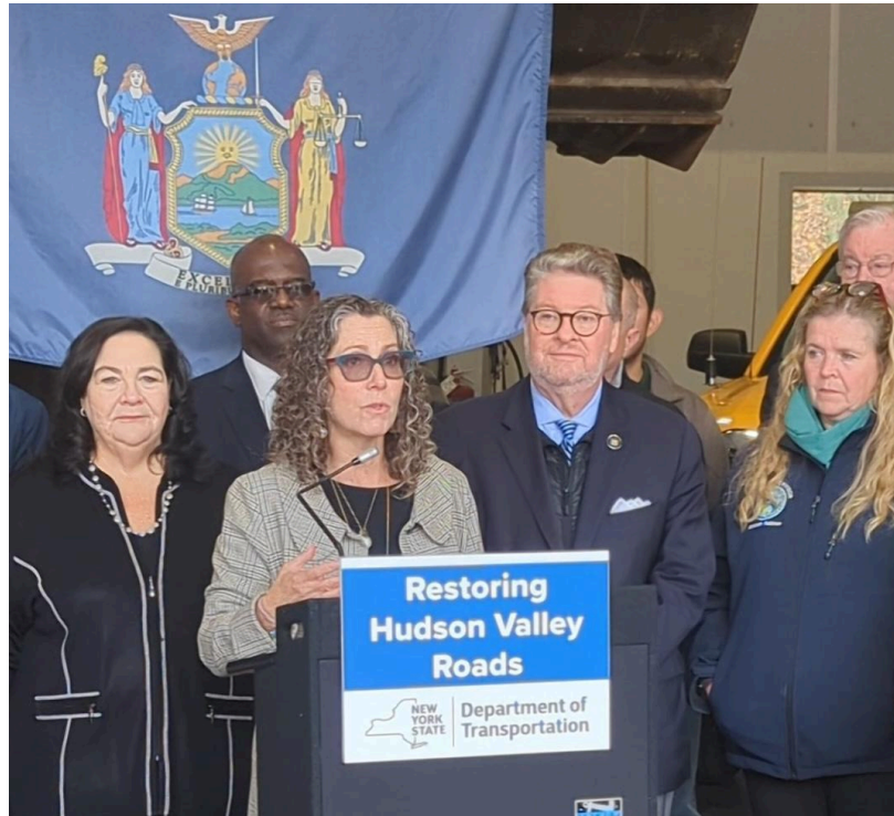
At a press conference announcing funding for the repaving of Route 133

keep working hard to ensure that all of our troubled state roads get the attention and resources they require.