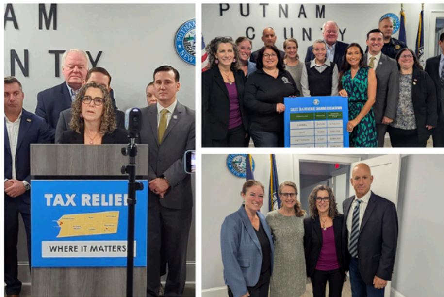
At a press conference announcing the signing of legislation authorizing sales tax sharing in Putnam County

One of my recently signed laws, A.7862A , will help stop the unethical practice of ballot line raiding as we head into the 2026 elections. In recent years, political operatives anticipating close elections have been running dubious campaigns on popular minor party lines (such as the Working Families Party line) to assist major party candidates, attempting to win elections without earning the support of a majority of voters through honest campaigns. This new law will give the state committees of minor parties the same ability to purge members that the Democratic, Republican and Conservative parties currently have through their county committees, enabling them to get rid of members suspected of such activity. I'm proud that this new law will help deprive bad actors of an opportunity to cheat their way to victory. With democracy under attack at the federal level, we must do everything in our power to ensure that New Yorkers are able to exercise their right to elect candidates they feel will represent their values.