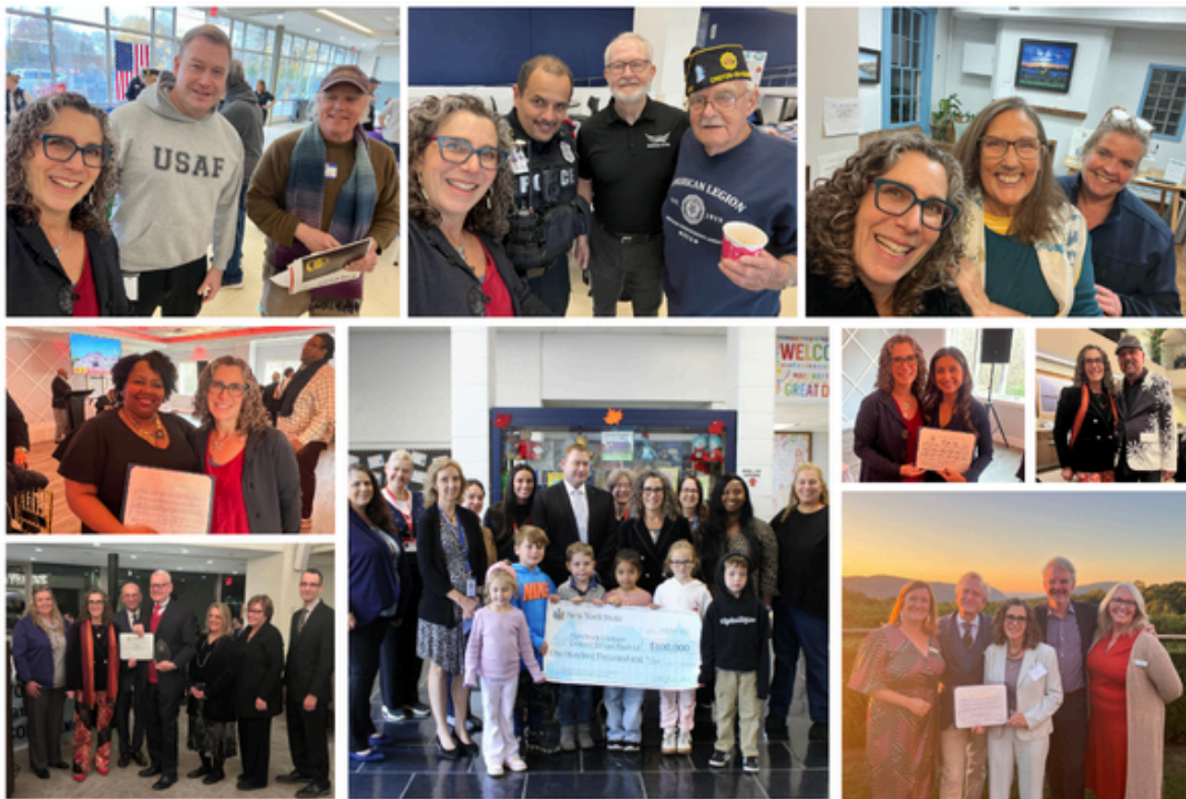
Photos from a few of the nearly 2,000 events and meetings I attended this year!

This year, I continued to work hard to pass legislation to make New York more affordable and sustainable. Eleven of my prime-sponsored bills were signed into law, along with 60 bills that I co-sponsored. Major new laws I co-sponsored include the Fostering Affordability and Integrity through Reasonable (FAIR) Business Practices Act ( A.8427 ); legislation enabling police to seize firearms when responding to reports of family violence ( A.544B ); a new law to address antisemitism and racism on college campuses ( A.5448B ); legislation to require