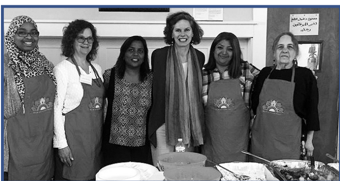
Assemblymember Fahy joined members of the Muslim Soup Kitchen Project (MSKP) for the first National Muslim Soup Kitchen Day at the newly reopened RISSE (Refugee and Immigrant Support Services at Emmaus) in Albany.

Heroin and opioid treatment and prevention. Landmark legislation to combat the heroin and opioid crisis in New York State passed the legislature and was signed by Governor Cuomo. The package of bills was passed as part of this year's session and marks a major step forward in the fight to increase access to treatment, expand prevention, while limiting the over-prescription of opioids in New York. The legislation includes several best practices and recommendations identified by the Governor's Heroin and Opioid Task Force, and builds on the state's aggressive efforts to break the cycle of heroin and opioid addiction.