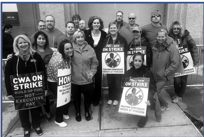
Proud to have stood alongside the IBEW, CWA, and Local 1118 in Albany during their strike against Verizon. Local union jobs are important to not only our community, but middle class families across the East Coast. FIOS, once built, can change the landscape to provide competitive telecom and broadband options for consumers.

Ridesharing legislation stalled. Ridesharing legislation to allow for services such as Uber and Lyft to operate in Upstate New York did not pass this session. As an original co-sponsor of legislation to enable these services, I recognize and value the economic development impact expected for the Capital Region. While this was an unexpected disappointment, there are a handful of differences that need to be reconciled (to protect drivers and passengers). I remain optimistic that a compromise will be reached by the end of the year if not by early next year to adopt protections and safeguards for drivers and passengers (such as the indemnification clause, multi-app coverage, and workers' compensation).