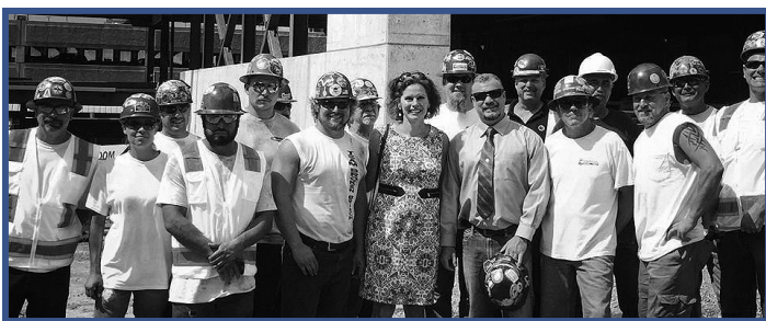
Assemblymember Fahy joins ironworkers at the Albany Capital Center construction site in Downtown Albany.

Archived records funding sweep protection passed. The legislature passed my bill (sponsored with Senator Ritchie) to ensure local governments have the resources they need to preserve and protect access to vital and archival records. Historically, the funding has been swept into the state general fund for other purposes. Under this legislation, the money would be distributed as local government grants for use as intended to preserve the Empire State's rich history.