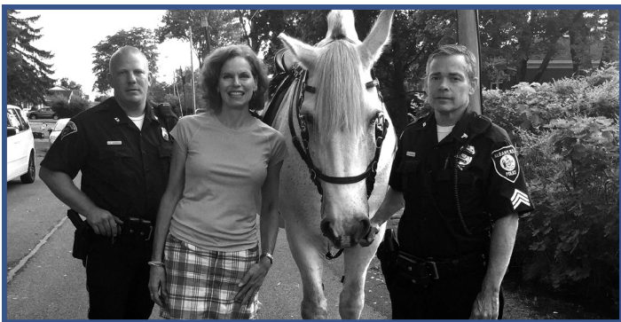
Assemblymember Fahy with Albany police officers during National Night Out.