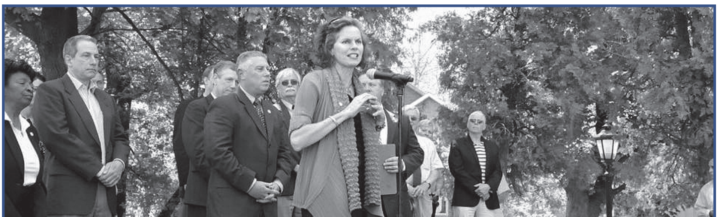
Assemblymember Fahy supported the expansion of the Albany County Rail Trail, which is a significant economic development investment for the area. She is pictured here with local officials from across Albany County at the opening of the Bethlehem section.