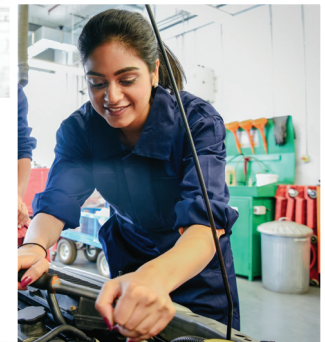
Vocational training lauded at Learning for Work forum