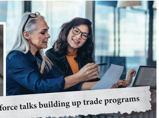
Task force talks building up trade programs