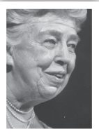
Eleanor Roosevelt (1884–1962)

Tubman escaped slavery in 1849 and became a conductor of the Underground Railroad. She risked her life to rescue slaves to freedom. She purchased land in Auburn in 1859 where she lived the rest of her life.