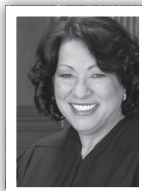
Sonia Sotomayor (1954– )

Heumann is a renowned disability rights advocate. She was confined to a wheelchair after suffering from polio as a child. She fought back against discrimination, becoming the first person in a wheelchair to teach in a New York City public school and helped develop the Individuals with Disabilities Education Act so that all kids with disabilities get the education they deserve.