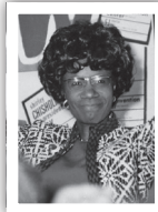
Shirley Chisholm (1924–2005)

Elion, of Manhattan, developed treatments for malaria, meningitis and leukemia. She earned a Nobel Prize in Medicine in 1988, one of only 10 women at the time who had earned a Nobel Prize in the sciences.