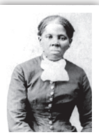
Harriet Tubman (c.1820–1913)