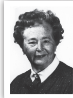
Gertrude B. Elion (1918–1999)

A lifelong New Yorker and first lady of the U.S. from 1933 to 1945, Roosevelt was a speaker and human rights advocate. She fought for disadvantaged Americans and drafted the UN Universal Declaration of Human Rights.