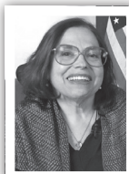
Judith Heumann (1947– )

Born in Brooklyn to immigrant parents, Chisholm was a member of the state Assembly and became the first African-American woman elected to Congress. In 1972, she was the first African-American and first female major-party candidate for the presidency.