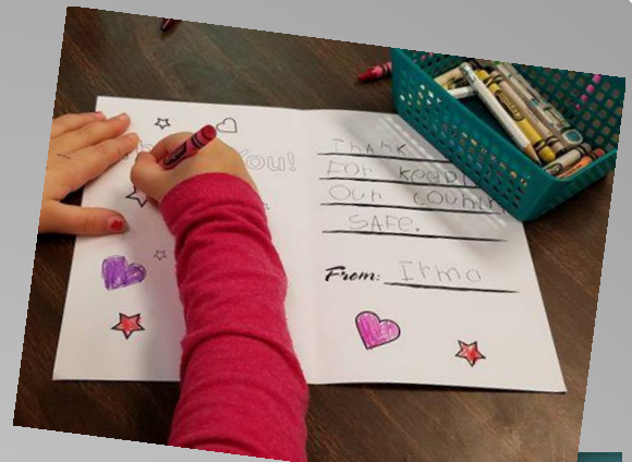
Pictured: Left: Package of Valentines heading to Camp Casey; Bottom Left: Delivering at VA Medical Center; Bottom Middle: Westcott Community Center Kid's Club; Bottom Right: Woodland Elementary Kindergarten Class