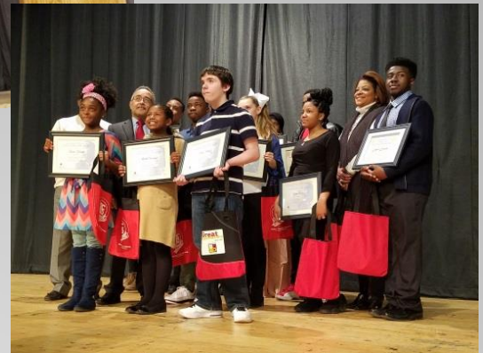
Pictured Below: Dr. King Community Award Winners