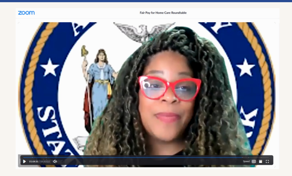
July 22, 2021

I took part in celebrating the 31st anniversary of the Americans with Disabilities Act. I was a panelist at an open round table discussion and dialogue on the Fair Pay for Home Care Bill.