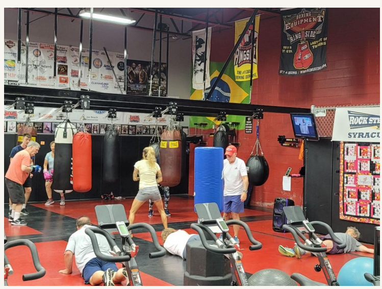
July 19, 2021

I was happy to visit Rock Steady Boxing Syracuse. RSB Syracuse is the cornerstone program offered by Empower Parkinson, Inc, a 501(c)3 not for profit corporation. Other programs include Yoga, Tai Chi, dance, nutrition, support group, chorus and balance classes.