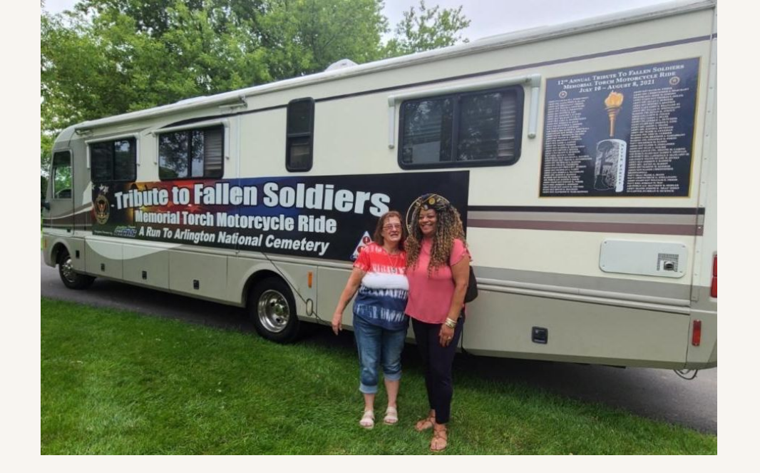
July 24, 2021

It was a pleasure to join in with the Onondaga Veterans Cemetery, General Pulaski, Post 1650 and welcome the Tribute to fallen soldiers memorial Torch motorcycle ride. This was a 24 day ride from Eugene, OR to Arlington National Cemetery and stopped at the Pulaski Post July 24th & 25th.