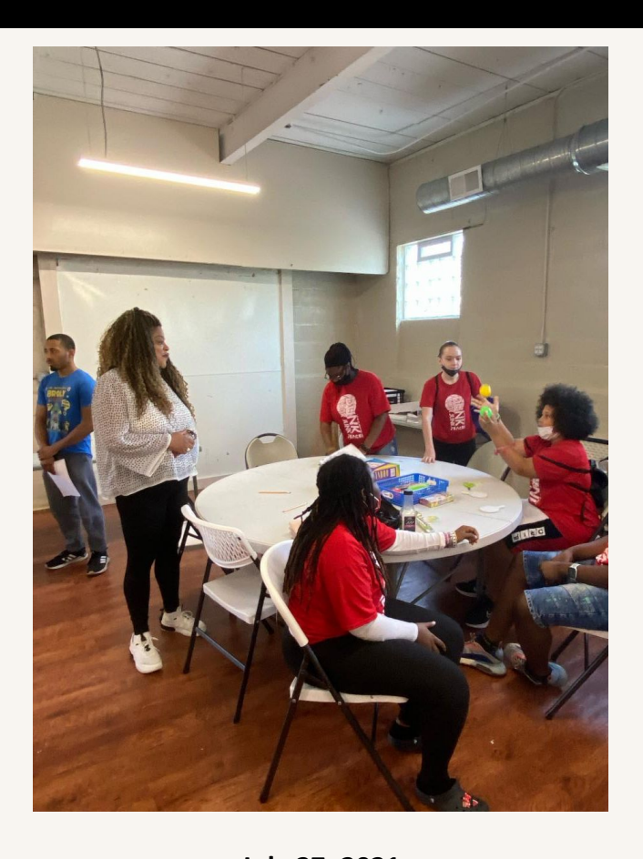
July 27, 2021

It spoke to middle school students at the "Let Me Be Great #44" Dunk Your Junk Summer Program. We had a discussion about how I got to where I am today, why voting is important, and what I do as a State Legislator in the NYS Assembly.