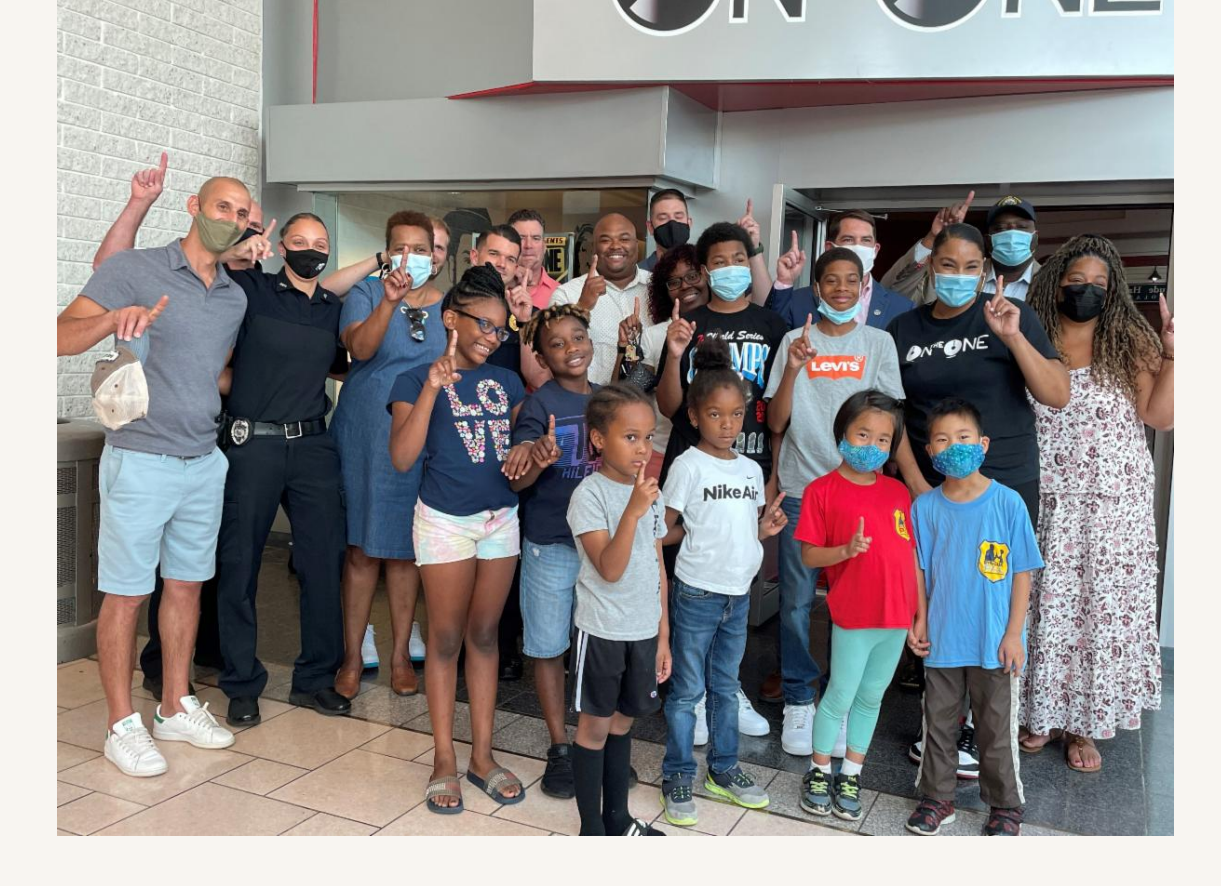
August 23, 2021

I was fortunate enough to secure $50,000 in funding to the <u>Syracuse PAL programming</u>. <u>Syracuse Pal's</u> mission is to connect cops, kids, and community.