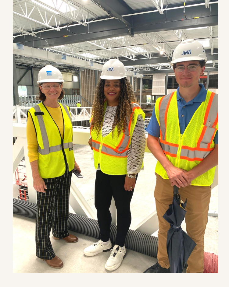
July 27, 2021

I toured the progress of the <u>JMA high-tech campus</u> project in Syracuse. JMA is now restoring U.S. leadership in wireless technology at a critical time in the transition to 5G. JMA makes the world's most advanced software-based 5G platform, which it designs, codes, and manufactures in the United States.