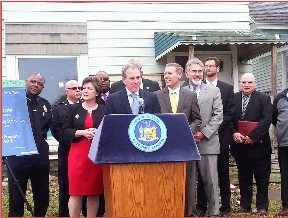
Attorney General Eric Schneiderman and state and local elected officials along with housing, community and law enforcement officials announced the Abandoned Property Neighborhood Relief Act.