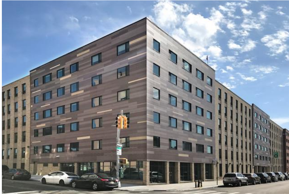
Win, Stone House Brownsville, Brooklyn

$5.2 million of HHAP funds helped leverage over $75 million in NYC subsidy and private investment. This is one of the final projects built under the NY/NY3 agreement between NYC and NYS.