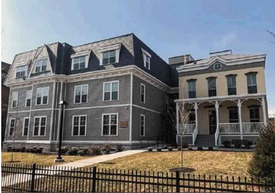
Albany Damien Center, Albany