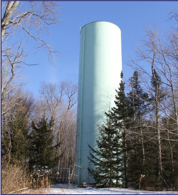
An elevated water storage tank in Tannersville, NY.

With a shortage of WIIA grant funds, projects to prevent contamination of drinking water have been kept on hold. As we'll see in this case study of Glens Falls, work as fundamental as ensuring that feces do not pollute drinking water has been unable to move forward due to a lack of state assistance.