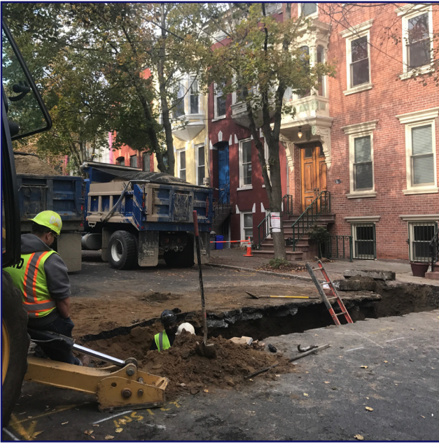
Water main break in the Center Square neighborhood of Albany, NY.

In 2014, there was a proposal to redirect $500 million from the New York City portion of the clean water loan program to fund the construction of the Tappan Zee Bridge replacement. Though that effort was thwarted, it led Environmental Advocates and other organizations to question why such a large pot of money was not being spent. In early 2015, Governor Cuomo and the State Legislature responded by creating the Water Infrastructure Improvement Act to provide grants that, when coupled with loans, could address the financial hardship that many communities face when securing funding for water infrastructure projects.