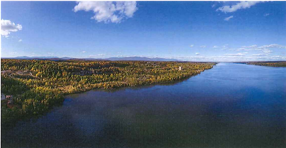
A new 508-acre park is within walking distance for many residents of Kingston

A new 508-acre state park in Kingston, Ulster County, that will protect over a mile of waterfront and create a series of trails that interweave with the Empire State Trail. Scenic Hudson would welcome the opportunity to provide a tour of this unique site within walking distance of a prominent Mid-Hudson city to members of the Legislature.