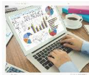
Adapted from www.gettingitrightfromthestart.org