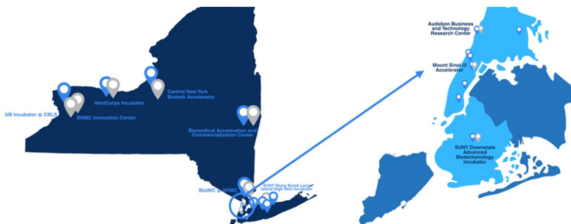
Figure 1. Geographic distribution of New York's medical schools, incubators and accelerators.

More than 35,000 New Yorkers are employed in biomedical research. At our medical schools alone, more than 17,000 people are directly engaged in research, with an employment multiplier of 2.35 (meaning that for every research job at our academic medical centers an additional 1.35 jobs are supported in the state economy) and generating $8.3 billion in economic activity.