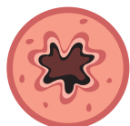
ASTHMATIC AIRWAY DURING ATTACK